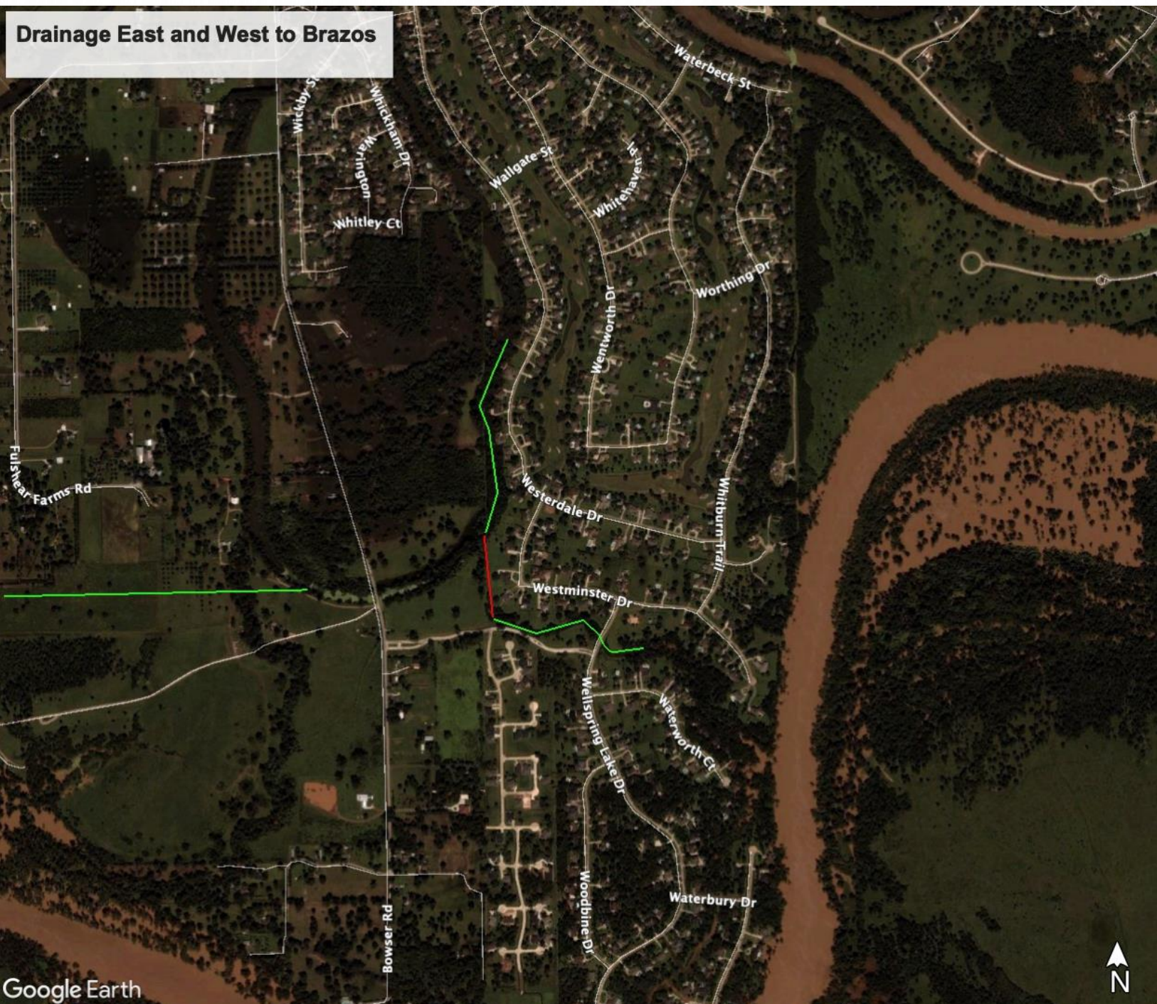
Drainage Paths East (Project U) and West (Project T)